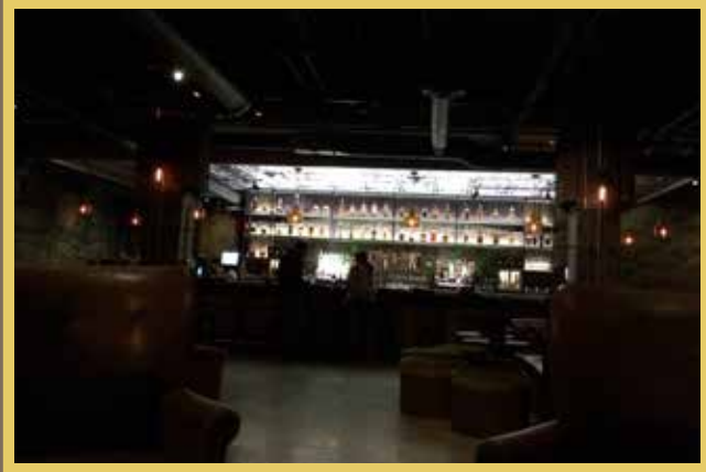
Public Bar | Kitchen in Lowertown Saint Paul