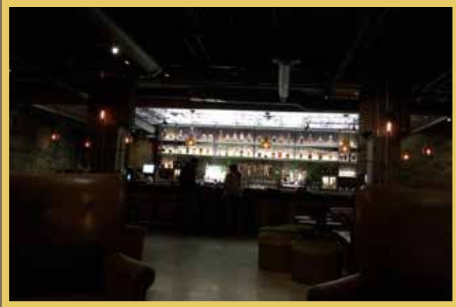
Public Bar | Kitchen in Lowertown Saint Paul