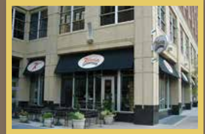
Kincaid's in Saint Paul

A reservation kiosk will also be available on-site on March 16 to assist you.